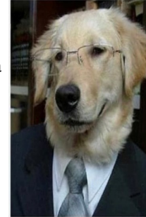
FIDO BONA ESQ Pawfirm Owner

Did your human break a treat in half and try to pass it off as a whole treat?