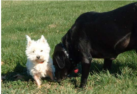
Scout and her "brother" Ranger

yard. Now she explores the entire yard with her brother Ranger (a black lab we rescued from the pound). She can be at the far end of the corner of the yard and when we call her she comes running as fast as she can.