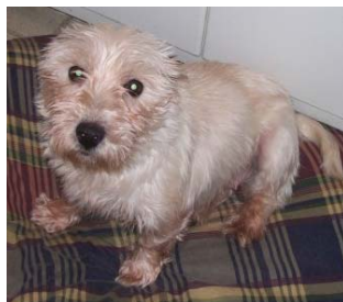
Alonsy (left), Owen (right), and all our 2008 Alumni say, "Thank you for helping Maryland Westie Rescue help us"