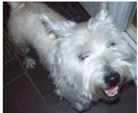
Beasley says "Hello"