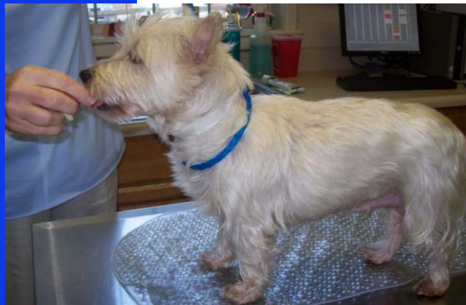
Missy Ann (now known as Piper) doesn't mind the vet, as long as she gets treats!