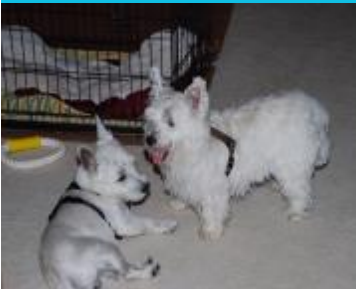
You come here often?