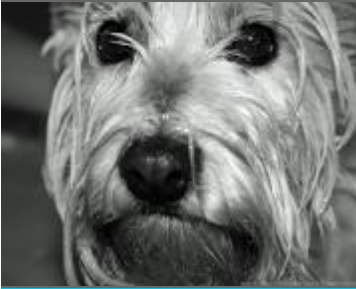
I SURVIVED IRENE!!!